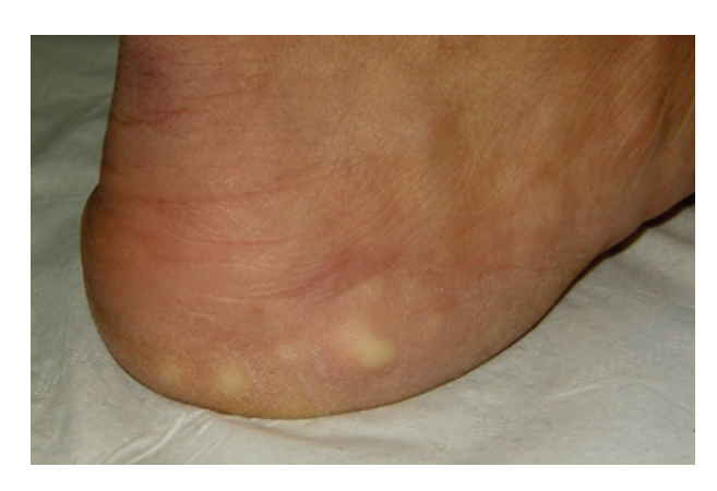
Figure 3. Piezogenic papules of the feet which are subcutaneous fat herniations through the fascia. They often appear as blanching white nodules only while bearing weight.