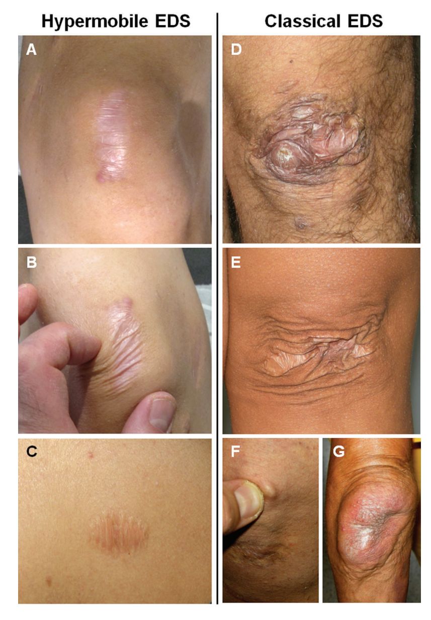
Figure 1. The atrophic skin/widened scars seen in hypermobile EDS as compared to classic EDS. Hypermobile EDS. Post-traumatic, atrophic, and widened scar in a young man ( A ). Skin stretching between the examiner's fingers discloses mild atrophy of the underlying dermis ( B ). A further atrophic and widened scar due to wound healing delay after excision of a melanocytic nevus in a young woman ( C ). Classical EDS. Typical papyraceous and hemosideric scar after repetitive wound re-opening and molluscoid pseudotumor in an adult man ( D ). Papyraceous, but not hemosideric scar and acquired cutis laxa in a young woman ( E ). Subcutaneous spheroid ( F ). Huge molluscoid pseudotumor of the elbow ( G ).

More than 90% of cEDS patients harbor a heterozygous mutation in one of the genes encoding type V collagen (COL5A1 and COL5A2).